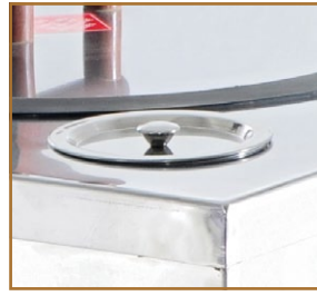
Stainless Steel Basting Bowl