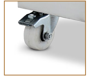
Lockable Heavy Duty Wheels