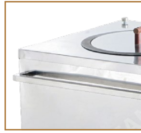
Stainless Steel Towel Hanger